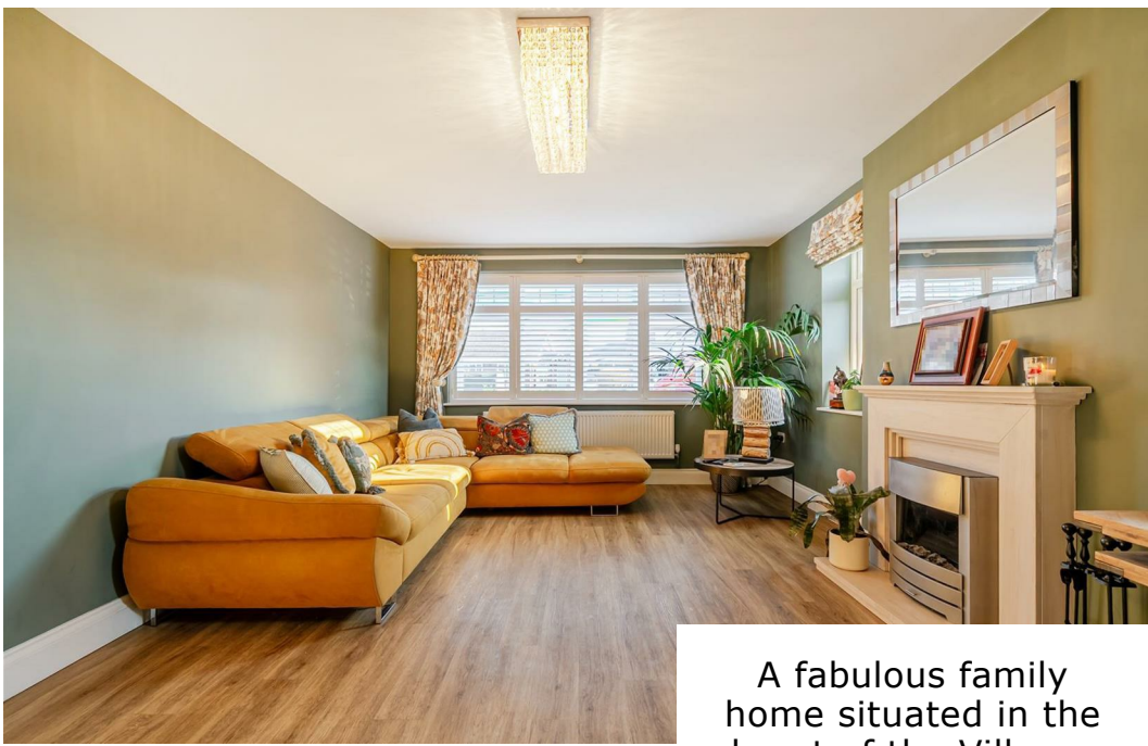
A fabulous family home situated in the heart of the Village.